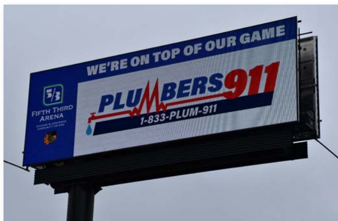
Digital billboard on I-290.