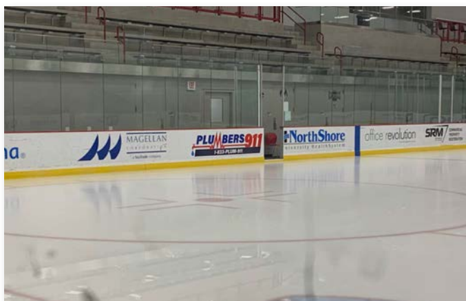
Dashboards at Fifth Third Ice Arena.