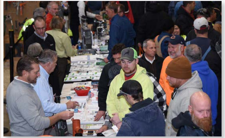
ASSE Product Show.