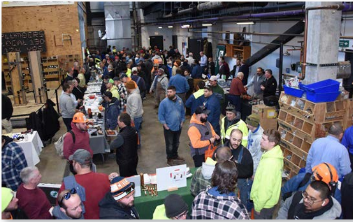
ASSE Product Show.