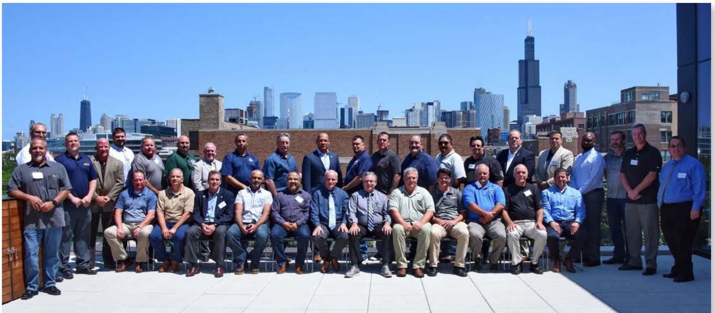
UA Business Managers that attended the meeting.